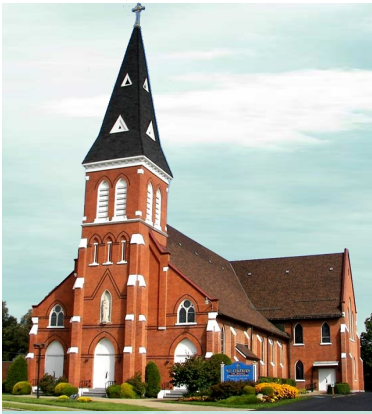
Saint Thomas the Apostle Church 203 W. Washington Street Corry, PA 16407